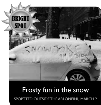
Frosty fun in the snow

Contributions, preferably by email to: kevinroylittle@hotmail.com or, if that's not possible, through my letterbox.