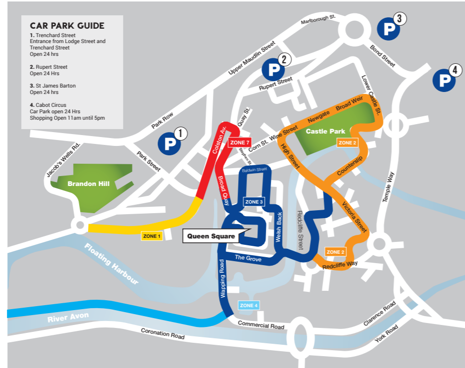
Contains OS data (©) Crown Copyright & Database right (2018)